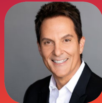
ROGER LOVE THE #1 VOICE COACH IN AMERICA

It's the greatest tool of influence you will ever own."